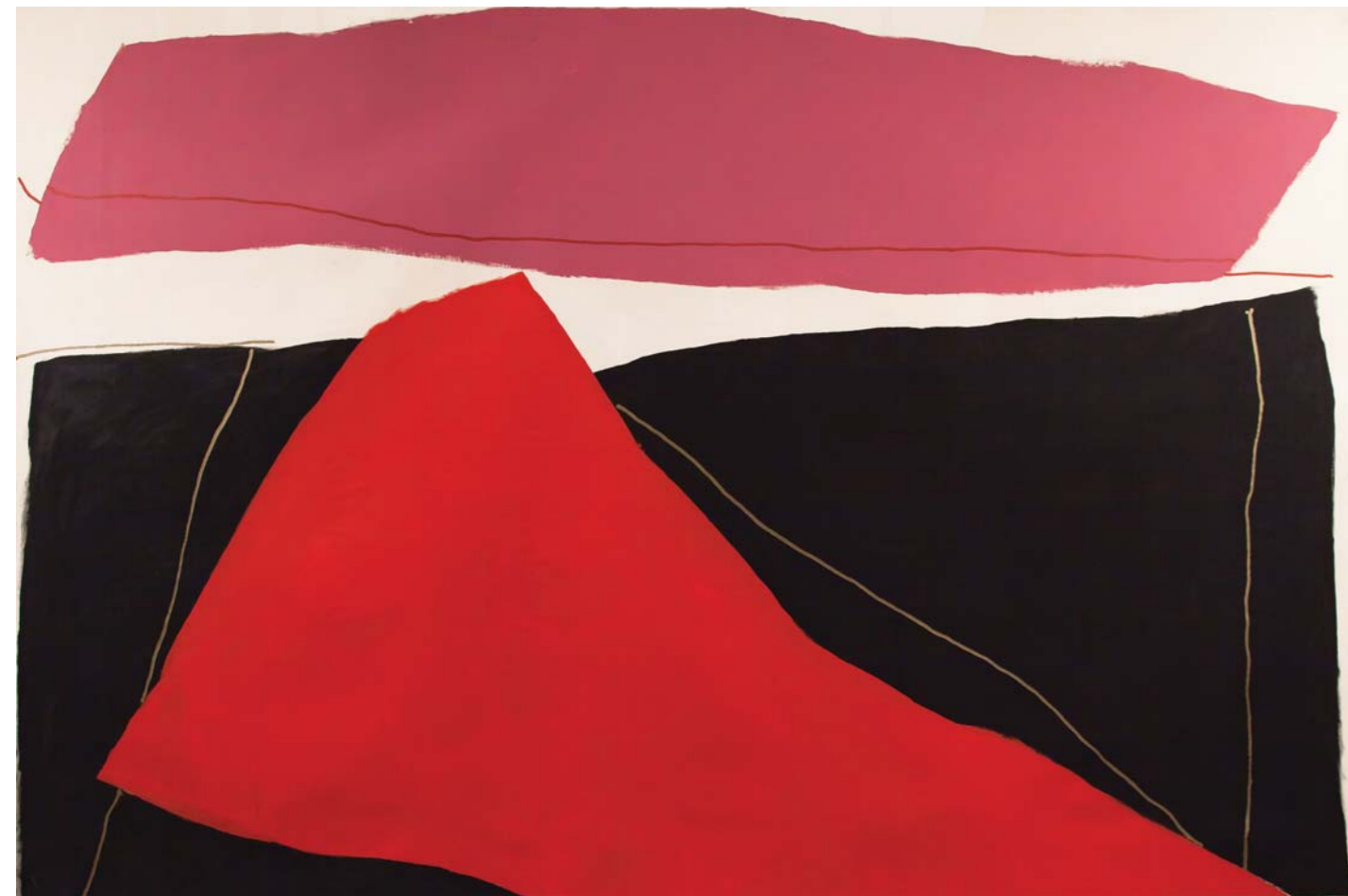
Untitled [537], 1981, acrylic on canvas, 90" x 136"