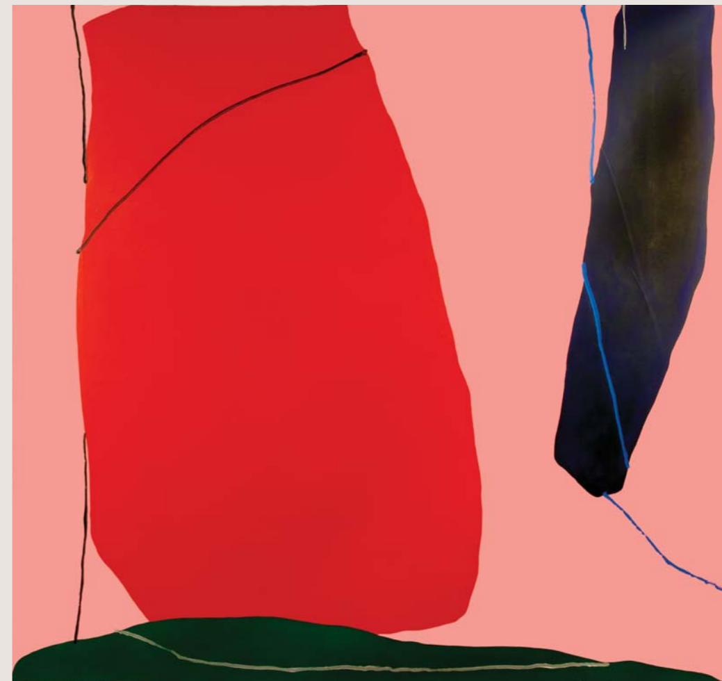
Untitled [586], 1984, acrylic on canvas, 82 x 77"