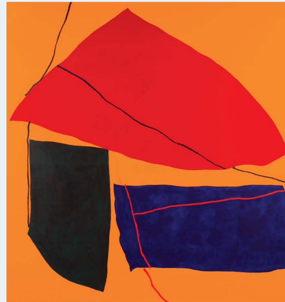
Untitled [582] 1994, acrylic on canvas, 82" x 77"

In these paintings, Parker had found his own way to fuse color and line, in both process and outcome. In his so-called Simple Paintings , Parker had, in his own words, “let color tell the whole story.” But he also said that by 1965 he was over “the fear that drawing could be corny....Quitting the myth that a painter must be innocent of the artifice of art freed me of the limits and rules I had made for myself for color and field.” These paintings are a result of that newfound freedom. They also represent a more personal fusion: Parker painted these in the last decade of his life, and in them we can see Parker coming full circle. The three larger paintings in this show hark back to the Simple Paintings , with their bare primed canvas as base, while the comparatively smaller paintings retain the solid unmodulated color ground of Parker's paintings of the 1970s. In all of them, he reintroduced elements of drawing, harking back to his very earliest work and his student years at Iowa. Parker, here, gives us a beautiful and confident synthesis of various elements tested in other formats and combinations over the years, presented with clarity and confidence, just as they always had been but now anew.