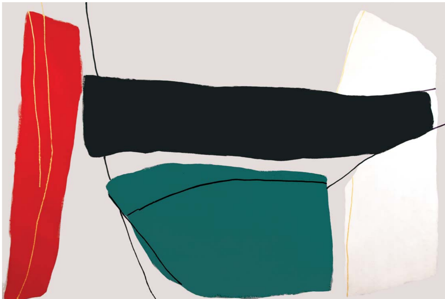
Untitled [808] 1981, acrylic on canvas, 89" x 133" Americanreal.com\ARA\Data\FW\SVF\Properties\499 Park Avenue\Art Exhibits\Final Printers_Jan_Export_2019 to Present_2034_0203 Ray Parker_Color Into Line

But the introduction of line in these paintings tells us something more. Parker's lines are simultaneously precise and structural like