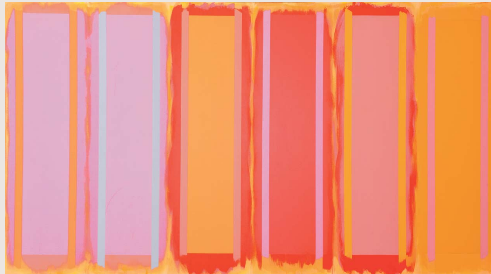
Parade Rest , 1996, Acrylic on canvas, 68 x 138 inches